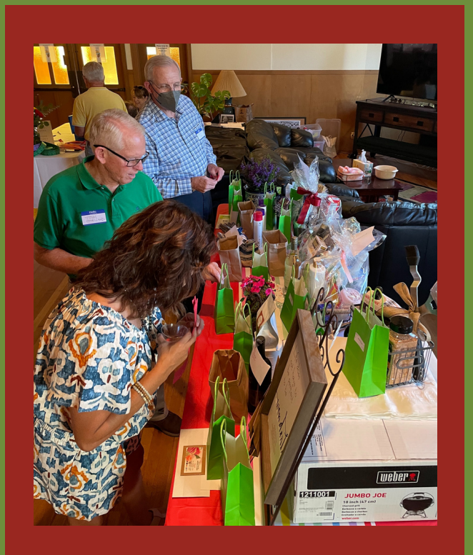
Silent Auction table